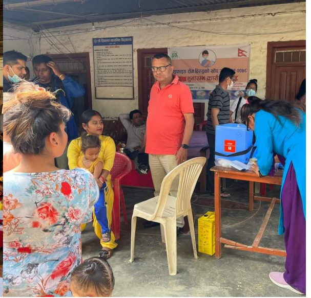
पर्वतका विभिन्न स्थानमा Typhoid खोप अभियानको अनुगमन तथा सूपरीवेक्षण