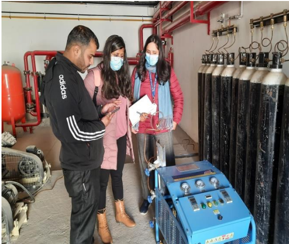
गोर्खा अस्पतालमा oxygen filling system सञ्चालनको बारेमा जानकारी लिँदै