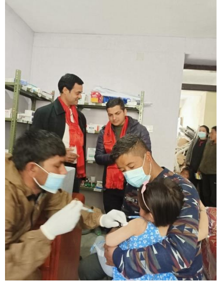
मनाङ्ग का विभिन्न स्थानमा Typhoid खोप अभियानको अनुगमन तथा सूपरीवेक्षण