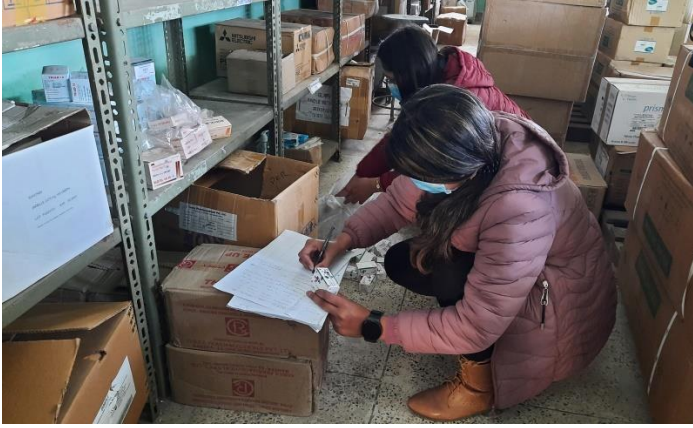
गोर्खा स्वास्थ्य कार्यालयको स्टोर सुपरिवेक्षण एवं अनुगमन