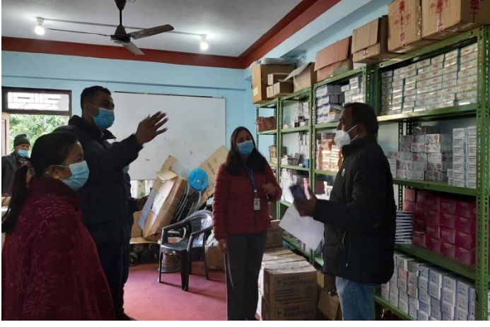
गोर्खा नगरपालिकाको स्टोर सुपरिवेक्षण एवं अनुगमन

अनुसूची १० विभिन्न जिल्ला स्थित स्वास्थ्य कार्यालय तथा अस्पतालहरूको औषधि तथा औषधिजन्य सामग्री एवं खोप आपूर्ति व्यवस्थापन कार्यको नियमित अनुगमन एवं सुपरीवेक्षणको कार्य सम्पन्न ।