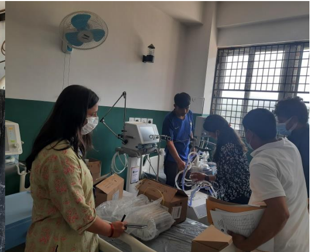
पर्वत अस्तालमा खरीद गरिएका Equipments हरुको post shipment inspection