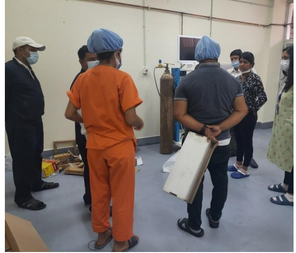
धौलागिरी अस्पताल बागलुङमा हस्तान्तरण गरीएको Laparoscopic Machine जडान तथा Installation