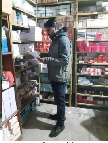
ब्यास नगरपालिका, दमौलीमा स्टोर सुपरिवेक्षण एवं अनुगमन